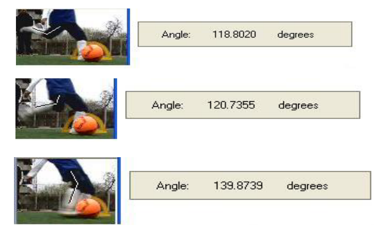
Figure 2: Successive video frames used for geometrical measurements

In order to determine these kinematic parameters, the videographical method was used, using a camera with normal recording. Then, using specialized programs of decomposition into separate frames (frame by frame) and of measurement of the angular or linear values, there were determined the kinematic parameters by the ratio between the angular or linear variation and the time variation between two successive video frames. Thus, in figure 2 there are represented a few successive frames used to angular measurements between thgih and shank for a junior football player during a direct free hit.