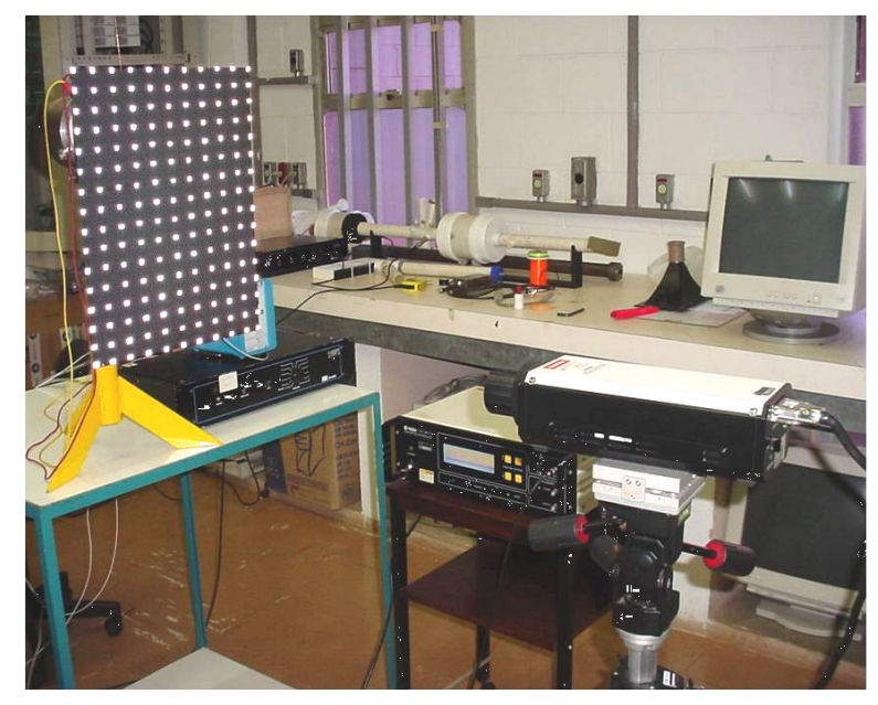
Figure 2: Experimental devices.

was performed in a frequency range of 0-200 Hz and results showed five different natural frequencies for this interval as shown in Figure 3.